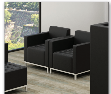
Contemporary & Chic Style For Any Collaborative Space